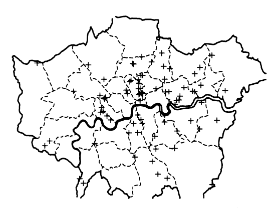
Figure 2 Distribution of incidents in Greater London.

Figure 1 Frequency distribution of falls by month of falls in study period.