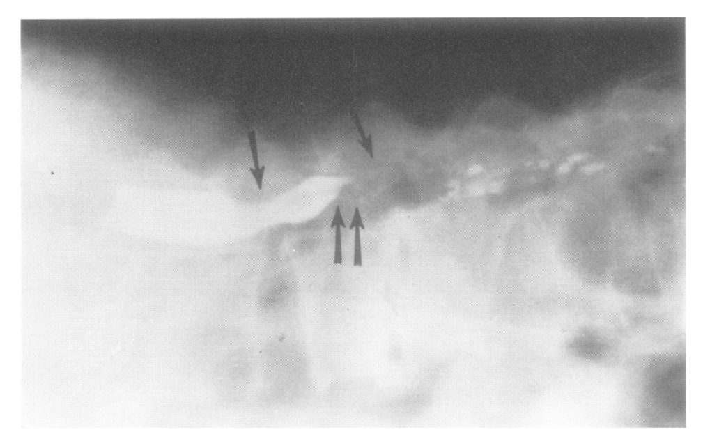
FIG. 3. Complete obstruction to the flow of iodophendylate by posterior spondylotic changes (single arrows) and extruded disc material anteriorly (double arrow).