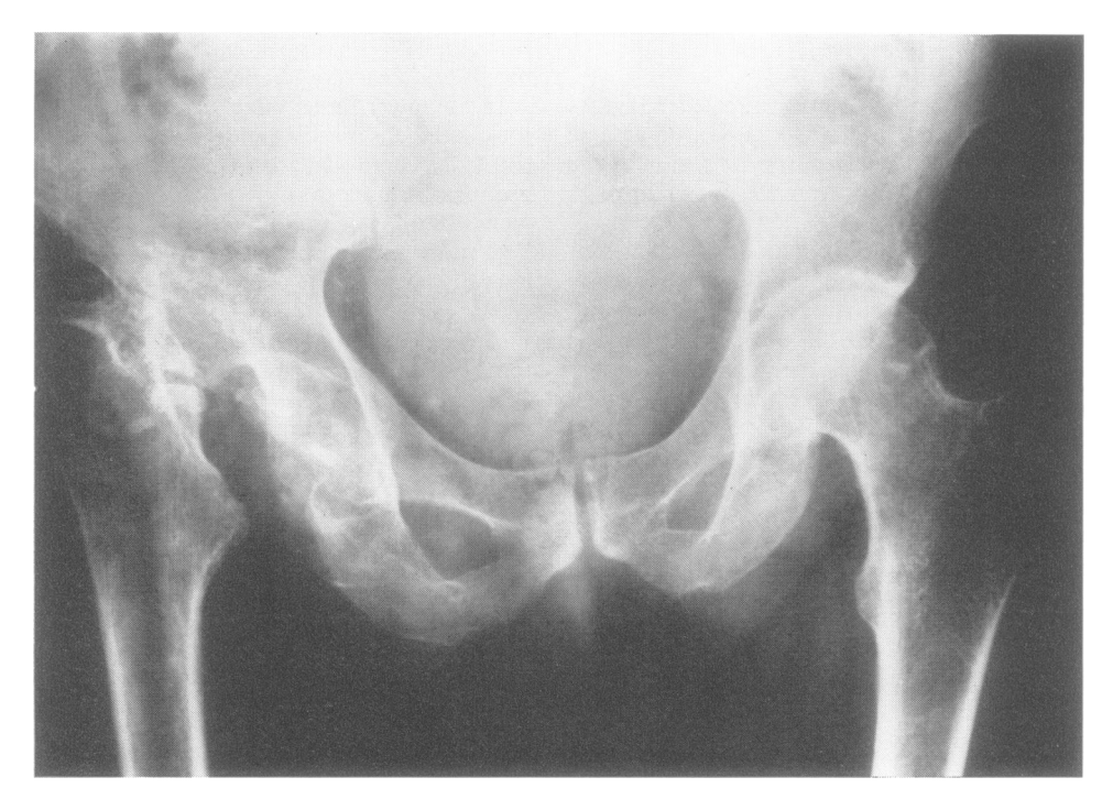
FIG. 2. Complete dislocation and disorganization of the right hip with much bony debris.