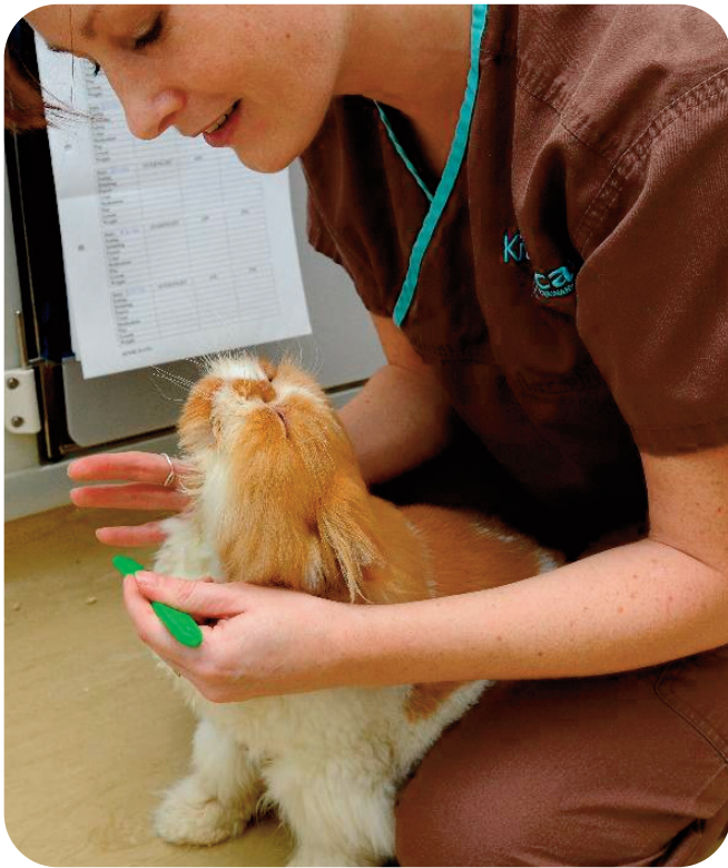
Figure 5: Nursing care and a quiet and calm environment with gentle handling are important aspects of pain management in a veterinary clinic.

groomed and fed. They may also be involved in providing non-medical pain control such as using cold packs on sore areas.