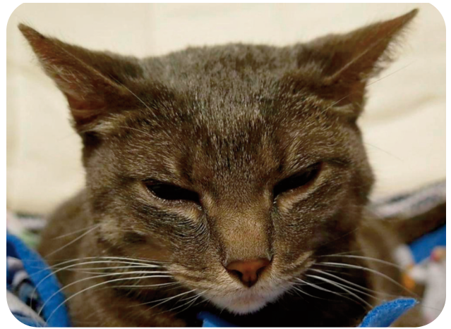
Figure 1: This cat is experiencing abdominal pain associated with severe constipation. Veterinary professionals look at ear position (in this case, ears drawn backwards with increased distance between the ear tips), eyes (partially closed), muzzle tension, whiskers (straight) and head position to indicate pain using the Feline Grimace Scale ( felinegrimacescale.com ). This pain assessment tool can also be used by owners/caregivers at home.

Most cats will undergo at least one surgical procedure in their lifetime, most commonly neutering and dental procedures, and any surgery is likely to be associated with some pain. Additionally, illnesses such as pancreatitis, infections, abscesses and cancers, plus traumatic injuries such as broken bones or bruising from a car accident, or bites and scratches inflicted during a cat fight, will cause acute pain. It is reasonable to assume that anything that would cause us pain, will also cause pain in cats and be just as distressing for them.