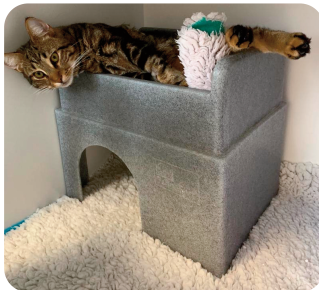
Figure 4: Hospitalised cats should have a comfortable bed and somewhere to hide, and should be kept away from dogs.

An important component of pain management is ensuring cats are not frightened during their hospital stay. They should have a comfortable bed (Figure 4) and somewhere to hide, and should always be handled gently and kept away from dogs. ISFM Cat Friendly Clinic and AAFP Cat Friendly Practice accredited clinics have worked hard to ensure that cats are cared for appropriately in the veterinary environment. (See catfriendlyclinic.org and catvets.com/cfp for more information and to find a clinic.)