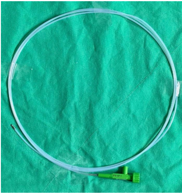
Figure E1. The spray catheter