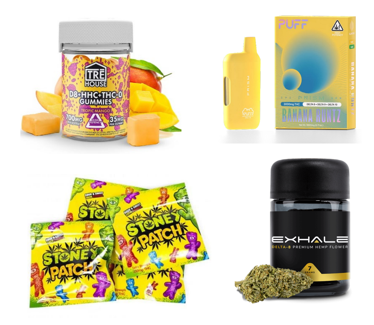
eFigure 1. Images of Example Delta-8-THC Products and Marketing