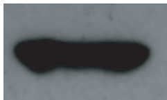
HER-2/neu (185 kD)