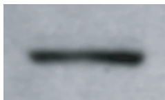
MAGE-1 (40 kD)