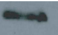
GAPDH (37 kD)