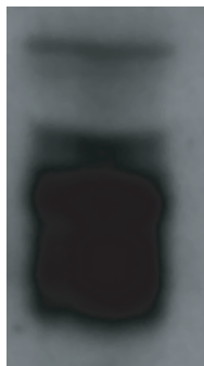
EMMPRIIN (~55 kD)