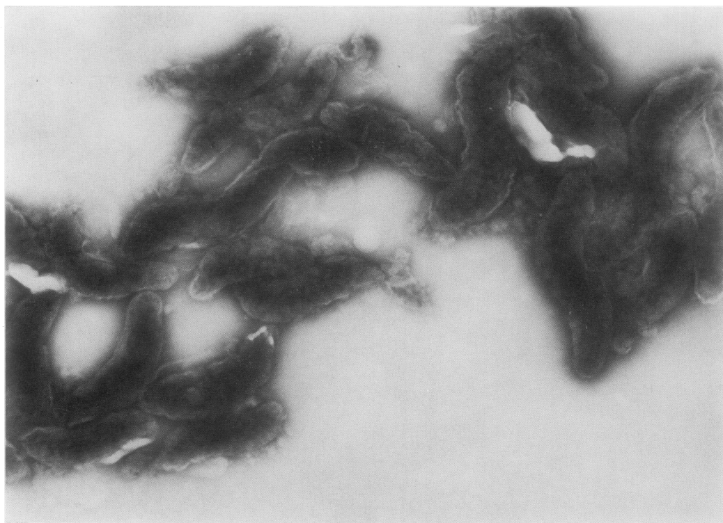
Fig. 2 Electron micrograph of suspension of Campylobacter jejuni/coli heated to 100°C for 15 minutes. \times 25\ 000 . Stained with 3% phosphotungstic acid (pH 6.5).

The results of the bactericidal test are shown in Table 3. The selected type strains were all killed by the corresponding antiserum at high dilution, and most of the heterologous antisera were without action. Two cross-reactions were observed. Type 2 strains were killed also by type 5 antiserum at high dilution, but type 5 strains were killed at low dilution only by type 2 antiserum. Absorption experiments showed that these strains had antigenic