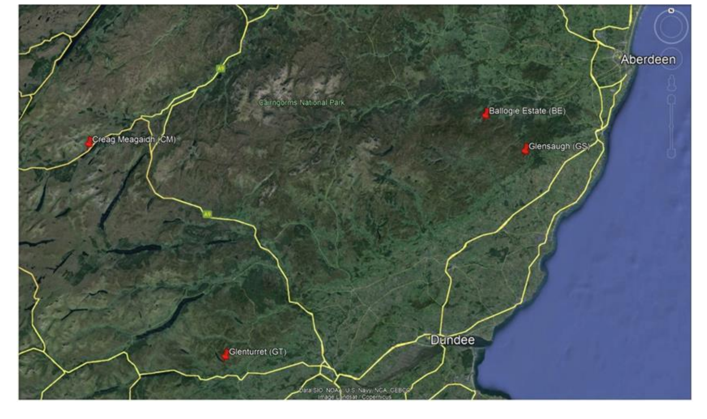
S Fig. 3a. Study sites located in Scotland UK. Altitudes are GS 323, BE 316, GT 351 and CM 291 masl.