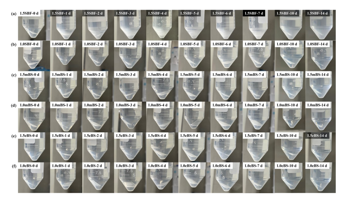
Figure S2 All the appearance on change of the solutions in a polypropylene tube containing slide glass after being kept at 37 °C for various periods up to 14 d.