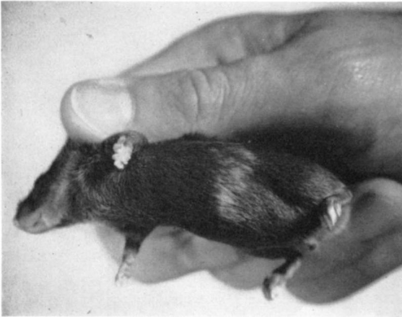
FIGURE 1.—An example of one of the larger mosaics. This animal, ♂636, was an offspring of the C57BL × NB cross and was irradiated with 100r X-rays, 10 \frac{1}{4} days postconception. The mutant spot occupied 0.0093 of the body surface and was grossly classified as "light gray."

enough to involve both c and p -loci (crossover distance between c and p : 16 in females, 12 in males).