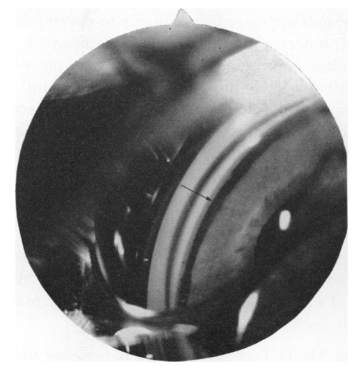
FIG. 7 Case 4. Extensive deep angle recession