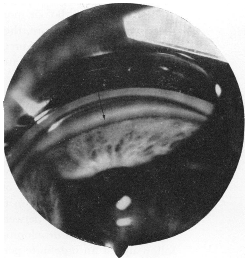
FIG. 6 Case 3. Corresponding area of uninjured eye, showing normal angle (arrow)