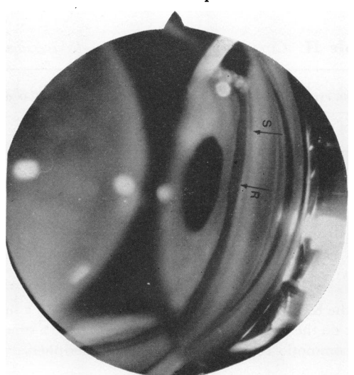
FIG. 3 Case 2. Angle recession involving entire sector of angle in this view (R) and Schlemm's canal (S). Note that blood fills the canal to the left of arrow but fails to fill the canal to right of arrow (possibly due to atrophy and fibrosis of canal and trabeculae in this area)

Figs 3 to 8 show the injured and uninjured eyes in three other patients (Cases 2, 3, and 4), in which the intraocular pressure remained normal.