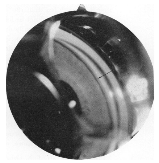
FIG. 8 Case 4. Corresponding area of uninjured eye

between 3 and 10 years of injury had glaucoma. The four cases of late glaucoma had more than 180^{\circ} of angle recession.