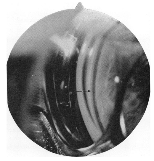
FIG. 4 Case 2. Normal angle of uninjured eye (arrow)