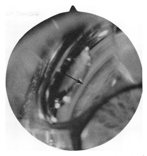
FIG. 2 Case 1. Corresponding area of uninjured eye showing normal angle (arrow)

Figs 3 to 8 show the injured and uninjured eyes in three other patients (Cases 2, 3, and 4), in which the intraocular pressure remained normal.