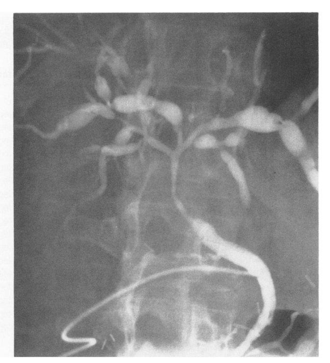
Figure 1. (A, left) Cholangiography obtained 10 days after OLT in a graft transplanted across the ABO barrier demonstrates early diffuse bile duct attenuation. (B, right) Cholangiography obtained 3 months after OLT of the same graft demonstrates late diffuse biliary strictures.

none in the control group did (p < 0.05). Additionally, a fifth patient in the ABO incompatible group had a mycotic aneurysm of the hepatic artery.