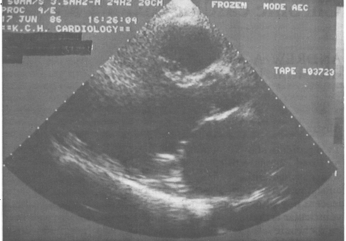
FIG 2—Case 2. Long axis echocardiograms showing (top) end diastolic and (bottom) end systolic images of left ventricle. Cavity is dilated and shows little change in chamber size after systolic contraction.

tion disclosed normal coronary arteries, an apical cardiomyopathy, and normal pulmonary artery pressure. There was mild mitral regurgitation. He was anticoagulated. He continued stable and well, working in his own business, until September 1985, when he was given a general anaesthetic for repair of an inguinal hernia. Routine halothane anaesthesia was used. Subsequently he rapidly became considerably more breathless but was not reinvestigated until February 1986.