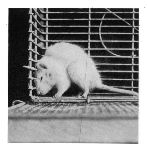
(A) Animal suffering from deficiency of vitamin B_4 .