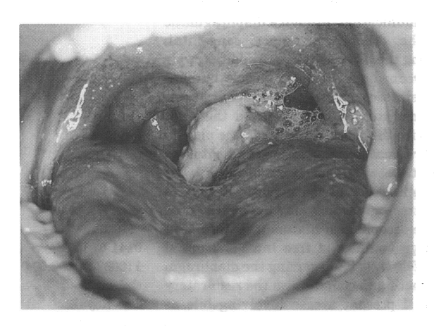
Figure 1. Tumour deposit arising from left tonsil

Physical examination of the thorax revealed slight shift of the mediastinum to the right and diminished air entry over the right hemithorax. Examination of the head and neck disclosed a large lobulated mass arising from the left tonsil, displacing the soft palate and extending across the midline of the oropharynx (Figure 1). An enlarged firm lymph node was palpable at the angle of the left mandible. There were no other physical signs.