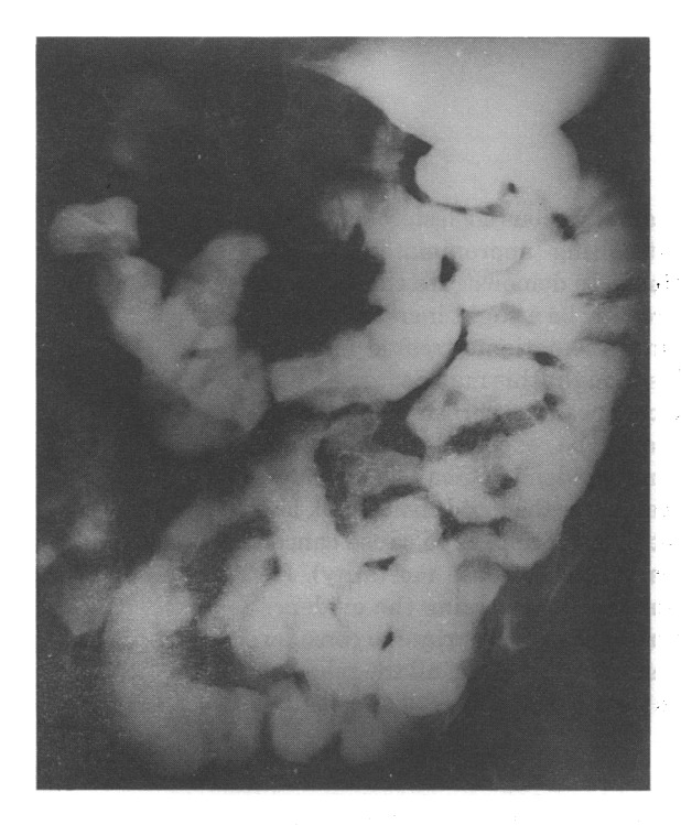
Figure 1. Diffuse enteropathy involving the entire small bowel, mild thickening of intestinal wall, sacculation of the antimesenteric border, total disappearance of the valvulae conniventes and coarse mucosal pattern. No intestinal dilatation

the mesenteric border with early sacculation of the antimesenteric border, diffuse ulceration, total disappearance of the valvulae conniventes and a coarse mucosal pattern (Figure 1).