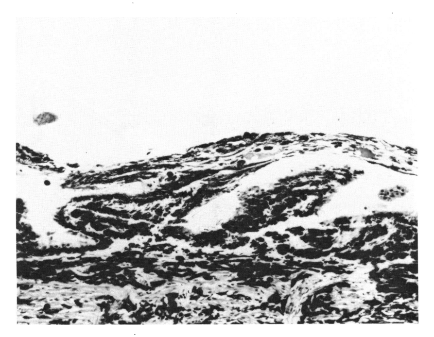
Light microscopic view of ciliary processes from eye of rhesus monkey 4 months after endoscopic cyclophotocoagulation, in which processes are largely replaced by fiberoptic mass of pigmented tissue (H&E, × 150).

was inserted through a pars plana incision and, under direct visualization with the endoscope, clusters of individual ciliary processes were photocoagulated at different energy levels. Histopathologic evaluation of the ciliary body from eyes enucleated immediately after therapy, revealed variable degrees of epithelial layer destruction and stromal hemorrhage (Fig 4), while the changes in eyes followed 1 to 8 months postoperatively, ranged from partial ciliary epithelial disruption and intrastromal pigment clumping, to replacement of the processes by a fiberoptic mass (Fig 5). Adjacent, untreated processes and underlying ciliary body tissue were not damaged. The degree of damage to treated processes correlated with the laser energy levels and especially with the immediate, visible tissue response.