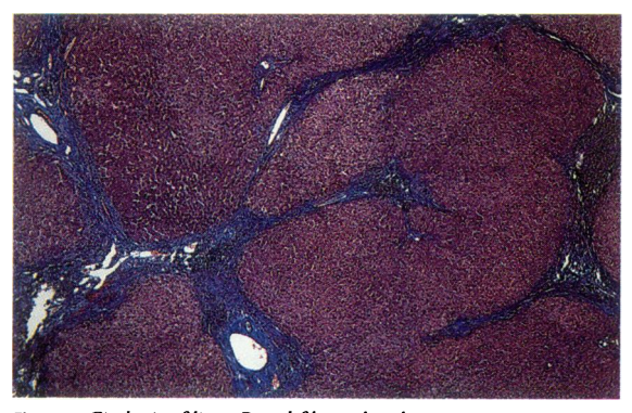
Figure 1 Cirrhosis of liver. Broad fibrous bands are seen connecting portal tracts and central veins, resulting in the formation of pseudolobules (trichrome stain, x10).

The exact prevalence of cirrhosis is not known because the disease is often silent. Nearly 30% to 40% of cases are discovered at autopsy, indicating that in a substantial proportion of people, the disease goes undetected during life. The number of deaths from cirrhosis in the United States varies from 12 to 15 per 100,000 population. The death rate dropped sharply to between 7 and 8 during Prohibition (1916-1932), but returned to the baseline after Prohibition laws were withdrawn.<sup>2</sup>