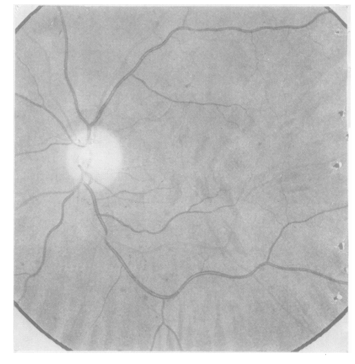
Fig. 1.—Left fundus of Case 2.

There is to date no record in the literature (apart from Lawrence's mention of Stawell's case), of fundus changes similar to those of diabetes mellitus occurring in patients with primary destruction of pancreatic tissue. Changes of this type have been observed (Fig. 1) in one patient (Case 2) of the present series. The