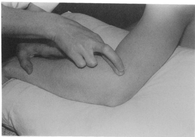
Figure 2. Frictions

Frictions are an accurately delivered penetrating pressure applied through the fingertips. The movement is mainly circular or transverse relative to the alignment of the underlying structures ( Figure 2 ) with minimal lateral movement. Frictions are aimed directly at the site of damage. Tendons and ligaments are treated under slight tension, while muscles are best manipulated in a relaxed position, thus avoiding excessive damage to the muscle cells.