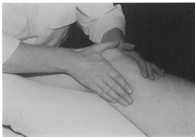
Figure 1. Effleurage

These slow rhythmic stroking hand movements, moulded to the shape of the skin, frequently begin and end a treatment session ( Figure 1 ). The strokes pass from distal to proximal and parallel to the long axis of the tissue. Gradual compression reduces muscle tone and induces a general state of relaxation that relieves muscle spasm and prepares the patient for more vigorous treatment. Firm pressure accelerates blood and lymph flow, improves tissue drainage and thus reduces recent swelling. Rapid strokes have the opposite effect. These will increase muscle tone and may be useful during the final preparation for competition.