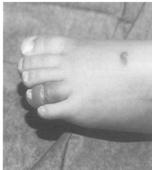
Figure 1 Constricting ring around the left fourth toe producing distal swelling and discolouration. There is no external sign of the causative hair.

Examination revealed a tight hair tourniquet proximal to the distal interphalangeal joint, with marked distal venous congestion. A knotted hair loop was removed surgically (figs 2