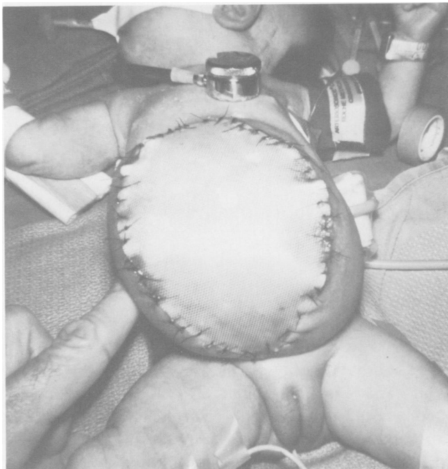
FIG. 3. Infant with severe viscerabdrominal disproportion in whom skin flap closure alone was not feasible and a temporary Silastic prosthesis was placed between the skin flaps.

An urgent attempt was made preoperatively to maintain normal body temperature by covering the viscera with a plastic bag and placing the infant in a heated Isolette (Fig. 4). Careful intravenous resuscitation was performed before anesthetizing the infant. Operative hypothermia was minimized by using an overhead infrared heating lamp during the early phase of the study. Moreover, since 1975, warmed humidified anesthetic gases have been used to reduce operative heat loss. Moist sponges were sparingly used to reduce