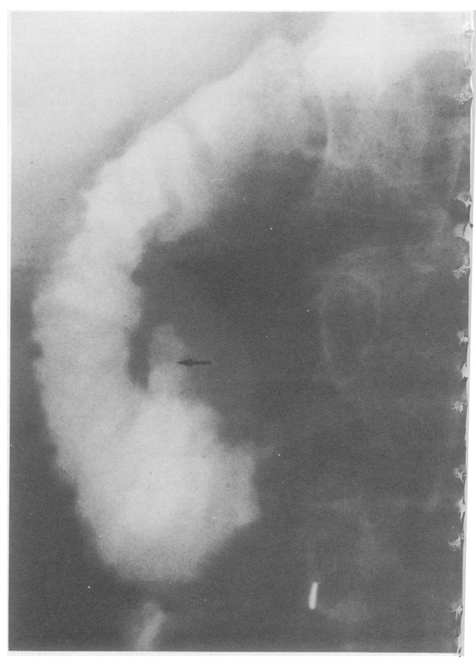
FIG. 2. Upper gastrointestinal series showing (arrow) extravasation from third part of duodenum at site of fistula.

Bleeding from aortoenteric fistulae can occur any.