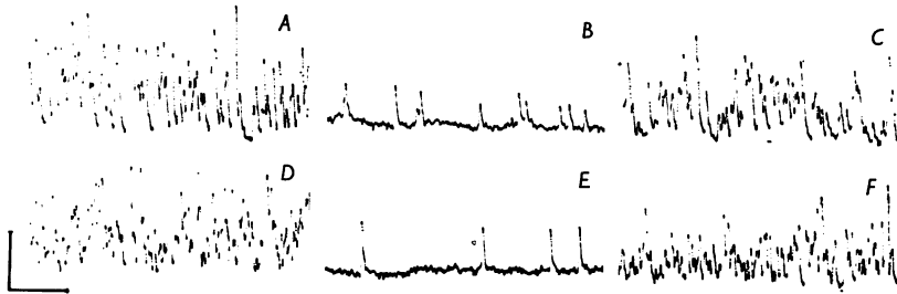
Fig. 2. Intracellular recording of m.e.p.p.s. fibre 1: A . After 3 hr in ouabain and 2 mM- \text{Ca}^{2+} (normal bathing solution); B . 5 min after increasing \text{Ca}^{2+} to 8 mM; C . 15 min after return to 2 mM- \text{Ca}^{2+} . Fibre 2: D . After 4 hr in ouabain and 2 mM- \text{Ca}^{2+} (normal bathing solution); E . 30 min after increasing \text{Ca}^{2+} to 8 mM; F . 5 min after \text{K}^+ concentration was increased to 20 mM (8 mM- \text{Ca}^{2+} still present). Ouabain (160 \mu\text{g}/\text{ml} .) was present throughout these experiments. Calibrations: 0.5 mV and 50 msec.

to about the level which was observed in this calcium concentration alone. These effects were reversible (Figs. 2 and 3). The full effect on m.e.p.p. frequency occurred sooner when calcium was added than the increase observed when the excess was removed. When the frequency in ouabain