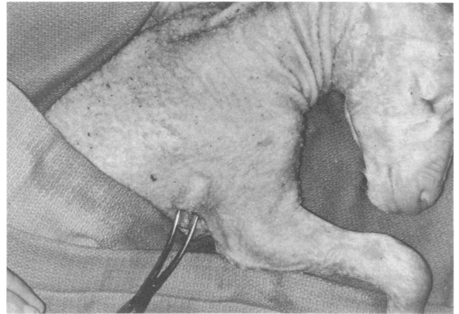
FIG. 2. Photograph of a wire mesh wound cylinder being placed into the right axillary subcutaneous pocket of a 100-day fetal lamb.

placed in separate subcutaneous pockets, and the wound was closed with interrupted 2-0 silk sutures. The adult wound fluid was harvested at the same time points as was the fetal fluid by aspirating the wound cylinders using sterile technique. The fluid was frozen at -70 C until analysis.