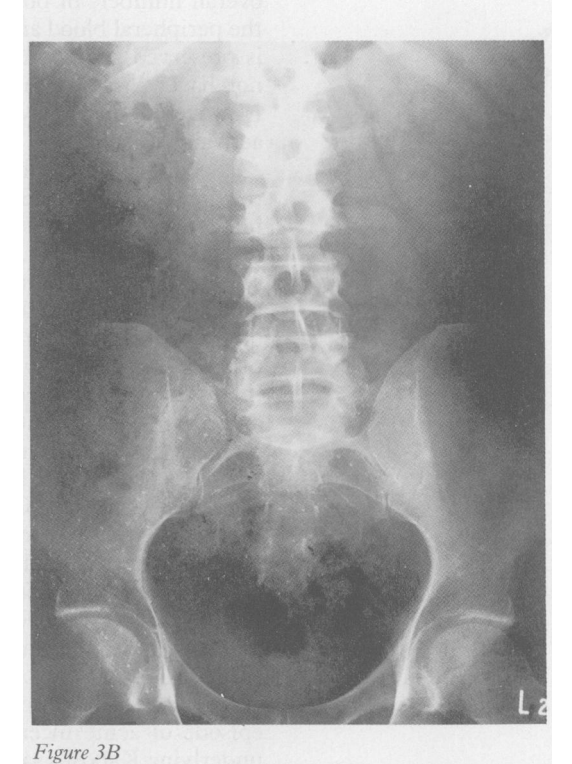
Figure 3: (a) Plain abdominal x ray with toxic dilatation affecting the transverse colon. (b) Repeat abdominal film after five days of intravenous hydrocortisone showing resolution of

There remains no evidence of cutaneous or oropharyngeal Kaposi's sarcoma.