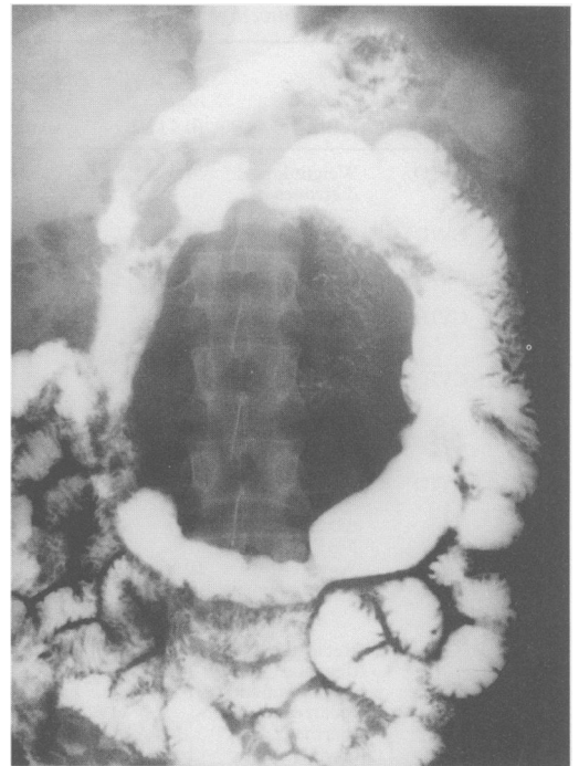
Figure 3: A small intestinal follow through showing jejunal strictures and separated jejunal loops because of a centrally located inflammatory mass.

pylori like organisms were identified in one patient.