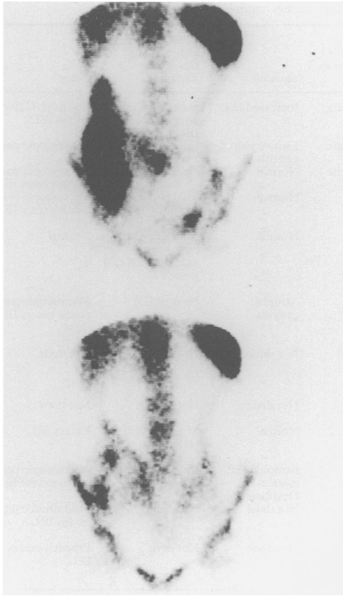
Figure 1: An abdominal ^{111}\text{indium} leucocyte scintigram from a patient with primary hypogammaglobulinaemia and diarrhoea (above) showing normal hepatic, splenic, and bony uptake of the labelled cells and an inflamed intestinal segment corresponding to ileum. The lower scintigram shows greatly reduced intestinal inflammation after treatment with elemental diet for four weeks.