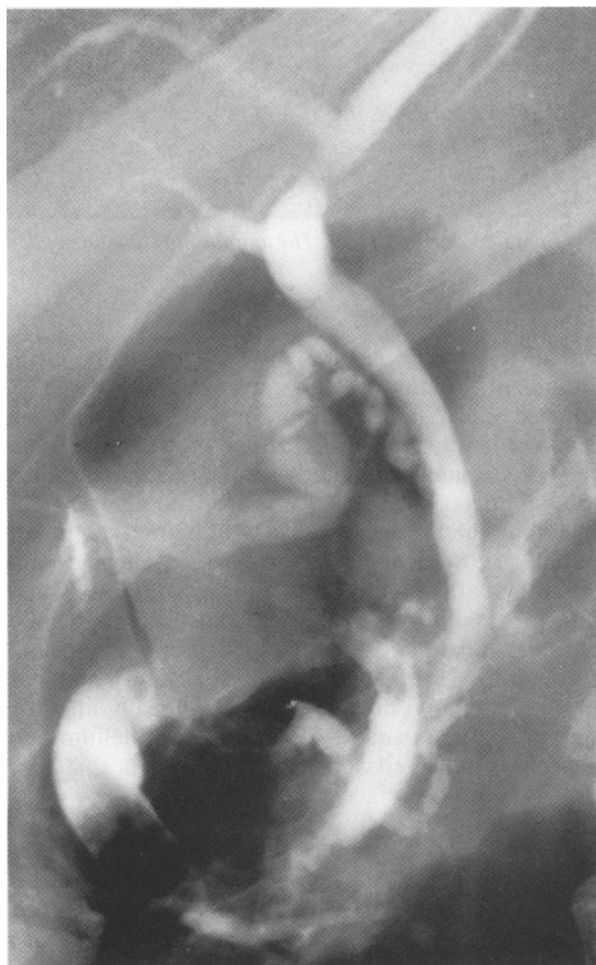
Fig. 1 Film of result of two separate injections at major papilla during ERCP.

Physical examination, routine biochemistry and serum amylase were normal. Plain abdominal films revealed speckled calcification in the pancreatic head region and a separate lateral calcified oval opacity. Ultrasound suggested chronic pancreatitis of the pancreatic head with calcification and an abnormal parenchymal echo pattern but the body and tail appeared normal and no pseudocyst was evident. Computed tomography (CT) scanning suggested some non-specific periduodenal thickening and con-