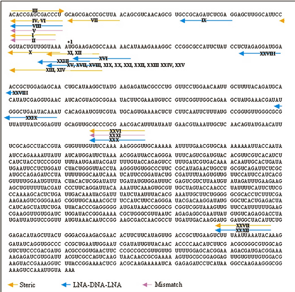
Figure S1. Panel A, schematic of luciferase mRNA. Panel B, mRNA sequence of luciferase and target sequence sites of the LNA and LNA-DNA chimera used in these studies.