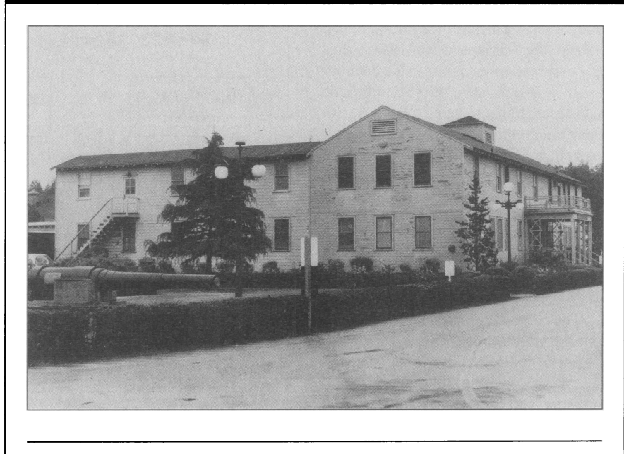
The Administration Building at Firland Sanatorium, circa 1960.

Yet even if it was reasonable to define active tuberculosis so broadly, sanatorium officials paid little or no attention to whether detained patients actually had active disease. This phenomenon had its major impact beginning in the mid-1950s when Firland adopted an informal policy requiring all alcoholics to remain hospitalized for 12 months, regardless of their medical condition.<sup>42</sup> This 1-year rule was another mechanism to ensure that Skid Roaders received adequate supervised antituberculous therapy. Because officials ignored the criterion of active disease, alcoholics who took unapproved leaves during the last days or