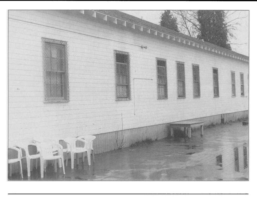
Heavily screened windows on the outside of Firland Sanatorium's locked ward. Photo by author, 1993.

authority this is being done."<sup>60</sup> Patient dissatisfaction culminated when a former Firland employee collected 51 pages of "patients' grievances," which he sent to the governor.<sup>61</sup>