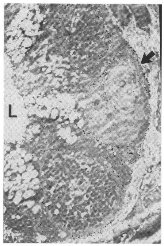
Figure 2: Electron microscopy of gastric body showing EGF-R positivity (visualised using gold tagged antibody) is present on the basolateral but not the apical (luminal, L) membranes of gastric glands. This is particularly well seen on the arrowed cell. Original magnification ×6000.

suggest that, in the normal human adult gut, the apical/surface membranes abutting the intestinal lumen do not express EGF-R.