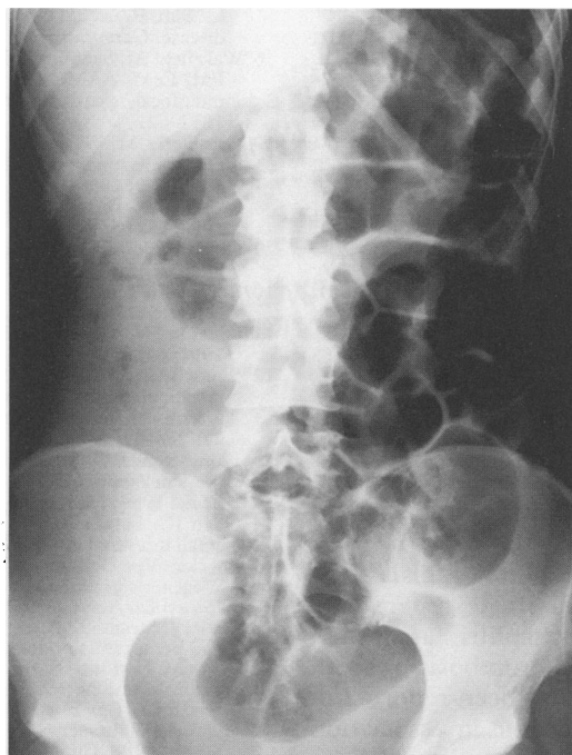
Figure 1: Plain abdominal radiograph showing dilated small intestine with an apparent mass containing a small amount of gas occupying most of the right side of the abdomen.

On examination she appeared unwell with a temperature of 39°C, pulse rate of 120 per minute, and blood pressure of 150/80 mm Hg. The abdomen was generally soft, apart from a tender mass in the right iliac fossa. There was a fleshy violaceous perianal area and, on sigmoidoscopy, the rectal mucosa was friable. Blood tests showed the following: the haemoglobin was 15.3 g/dl; white blood cell count 10 \times 10^9/l , platelets 453 \times 10^9/l , ESR 30 mm/h, and C reactive protein 240 mg/l. The liver function tests were normal, apart from an albumin of 19, and uncorrected calcium of 1.83 mmol/l. The plasma phosphate was normal. No malaria parasites were seen on a thick blood film. A 'hot' stool was examined for Entamoeba histolytica and was negative. The stool was also negative for cysts, ova, and parasites and culture was negative. Chest radiography was normal showing no free intraperitoneal air and abdominal x ray showed dilated small bowel with an apparent mass containing a small amount of gas occupying most of the right side of the abdomen (Fig 1). Ultrasound of the abdomen showed gross thickening of the caecum and proximal ascending colon with dilated small bowel loops and a small amount of free intraperitoneal fluid. Small bowel enema confirmed dilatation of the small bowel loops with a considerable delay of six hours before barium reached the caecum (Fig 2). Abdominal computed