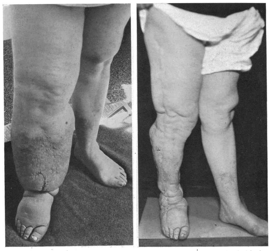
FIG. I.—(Case I.) Elephantiasis of right leg. FIG. 2.—(Case I.) Elephantiasis of right leg one and a half years after operation.

gradually worse and in December, 1929, it attained its present proportions. (Fig. 1.) The patient was at that time unable to walk or even to perform her household duties on account of the size of the leg. It began to ulcerate and discharge as much as a quart daily of clear white lymph. The patient has never been farther south than Washington. She states that three months prior to her initial swelling she fell and injured her spine. At the time of her examination by us there was, however, no evidence of injury. Her previous medical history was negative. No elephantiasis in family, apparently only one abortive attack of erysipelas. Mother of four children. Physical examination entirely negative except for her right leg. The lower leg is most markedly elephantoid. The