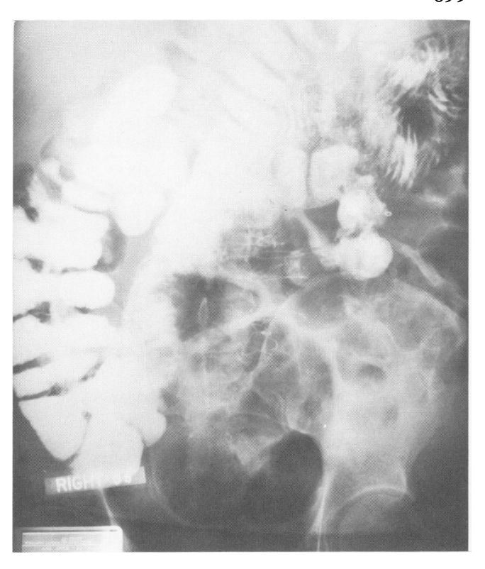
Fig. 3. The same patient after our modification. Notice the lack of reflux.

of a ventral hernia, a patient with less than 26 kg weight loss (after a Payne procedure) was subjected to a barium study of the gastrointestinal tract (Fig. 2). Reflux is noted in the defunctionalized segment. During repair of the hernia the abdominal cavity was entered and the modification was performed. Postoperatively a repeat barium study was performed (Fig. 3) and reflux has been completely eliminated; subsequently she has continued to lose weight. A second patient had similar x-rays and a similar result following modification.