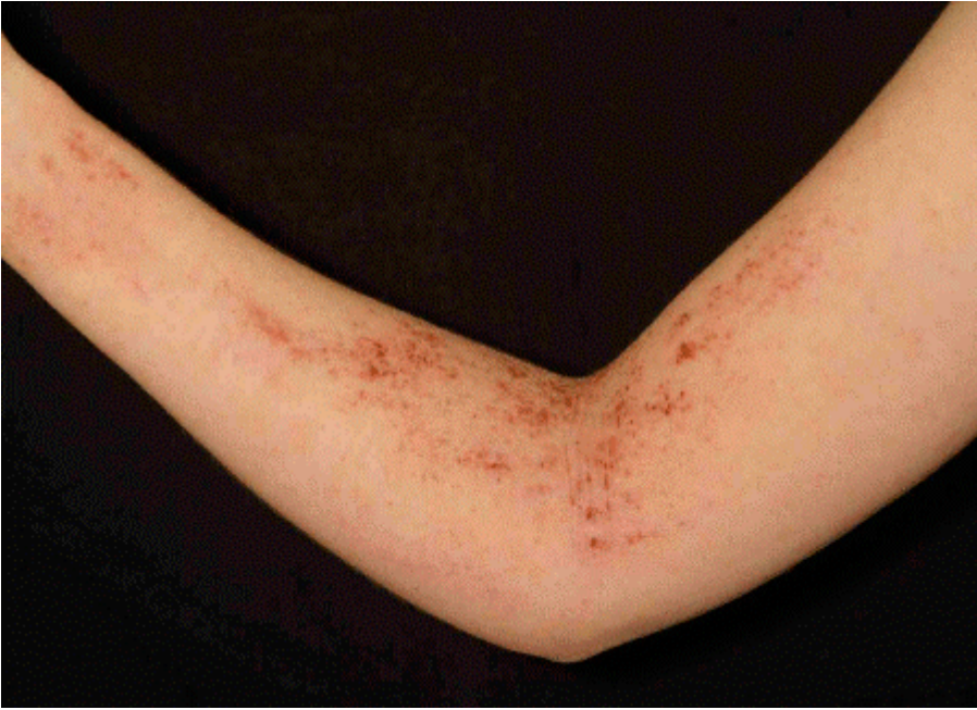
Figure 2: Atopic eczema on the arm flexures showing crusting associated with Staph aureus infection.