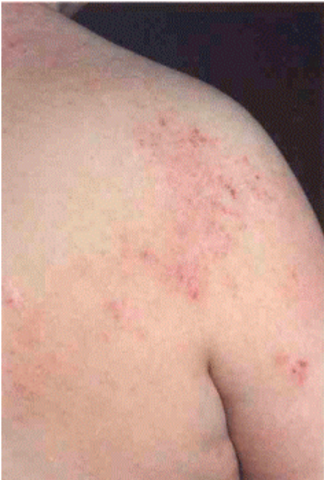
Figure 1: Atopic eczema on the shoulders and back, showing ill-defined patches of erythema and multiple excoriations.