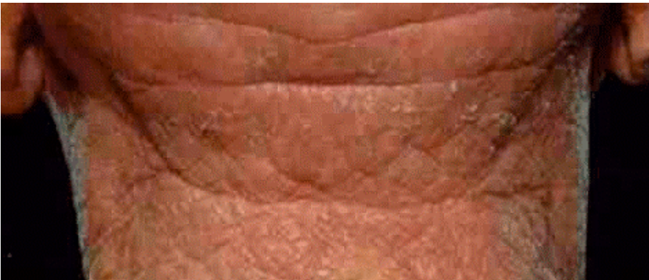
Figure 3: Atopic eczema on the posterior neck, showing erythema, scale and lichenification.