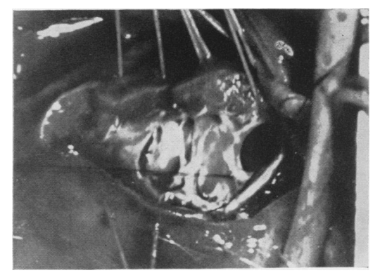
FIG. 3. Ventricular septal defect, located near apex, has fibrotic rim.

Etiology. Although various investigators have reported that 8 per cent ^{21} to 9 per