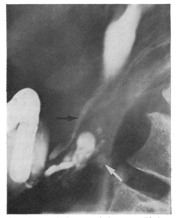
Fig. 3 (Patient 3) There is marked narrowing (black arrow) of the distal common bile duct. A short length of irregular, main pancreatic duct ends in a small cyst. Calcification is present in the head of the pancreas (white arrow).

cause was found in the other 11 patients. Twenty-five of the patients without cholestasis had minimal to moderate chronic pancreatitis. In only two patients were changes advanced.