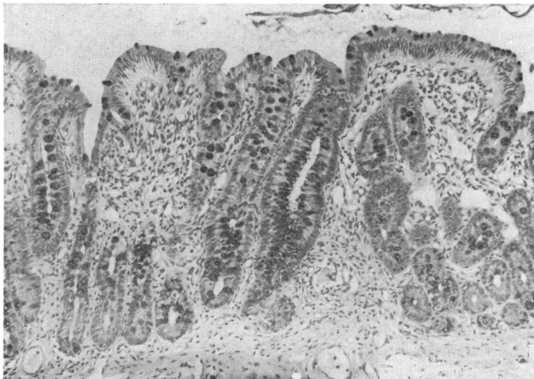
Fig 1 A 'flat' mucosa from a six-week old explant. \times 170 .