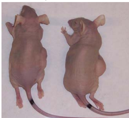
high PD 65yo hTERT