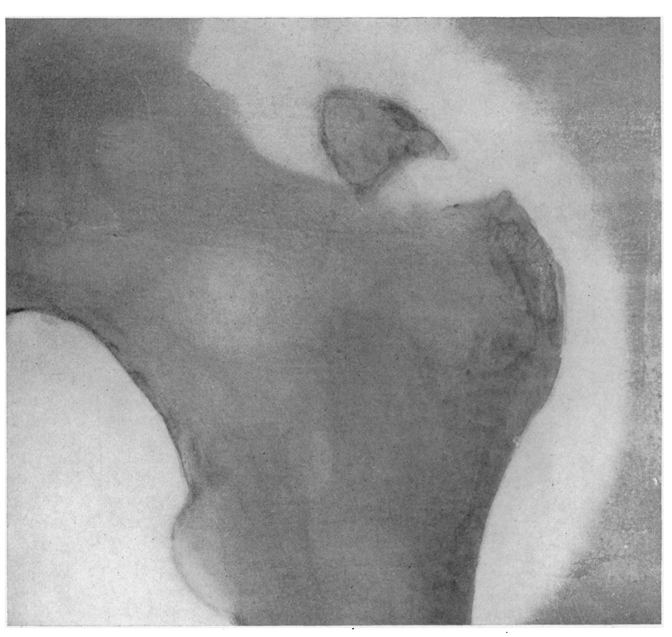
X-ray taken shortly after admission to the hospital.