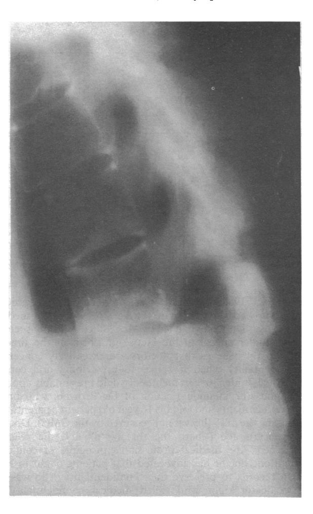
FIG 2—Lateral tomogram of the dorsolumbar spine of the patient in case 1, showing anterior discovertebral destruction and a stress fracture through the posterior elements of D11.

Patients with longstanding ankylosing spondylitis in whom bony fusion of the spine has occurred usually do not complain of backache. Discovertebral destructive lesions may arise at any stage of the disease but classically occur in the later stages when they may cause a recurrence of backache, the symptoms of which differ