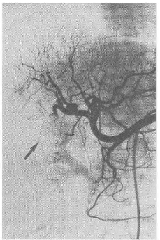
Fig. 3 Selective hepatic arteriogram, after embolisation. Segment containing site of arteriovenous fistula fails to opacify (arrow).

The direct arteriographic approach used here has a number of advantages. In the 10 patients in whom it has been used the bleeding site has been accurately located in all but one. This is of particular advantage if gastrointestinal haemorrhage after liver biopsy is not associated with either biliary colic or definite findings at endoscopy. Furthermore, definitive therapy can be instituted. One possible approach was used by Lee et al. , who infused adrenaline and propranolol into the right hepatic artery. After a half-hour infusion and after severe pain had developed, bleeding stopped. The other approach is that of direct embolisation of the bleeding site.