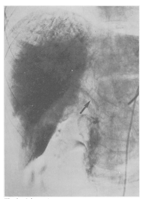
Fig. 2 Selective hepatic arteriogram. Late phase showing contrast medium in common bile duct (arrow).

In this particular patient, haemobilia after percutaneous liver biopsy was not a diagnostic problem; she presented the classical symptom complex of biliary colic, jaundice, and gastrointestinal haemorrhage, and endoscopy confirmed the diagnosis by showing fresh blood emerging from the ampulla of Vater. The management of this complication, however, remains difficult. In three of the 13 patients reported in the literature, bleeding ceased spontaneously after a period of conservative management with transfusion alone<sup>4 5 8</sup> but one fatality has followed this approach.10 Bleeding may also recur after a period of some weeks.8 Experience with haemobilia after blunt trauma to the abdomen has encouraged a policy of early surgical intervention<sup>12</sup> and some patients have therefore been treated with major procedures including hemi-hepatectomy and hepatic artery ligation<sup>47</sup>; these procedures have a significant mortality of their own, particularly in