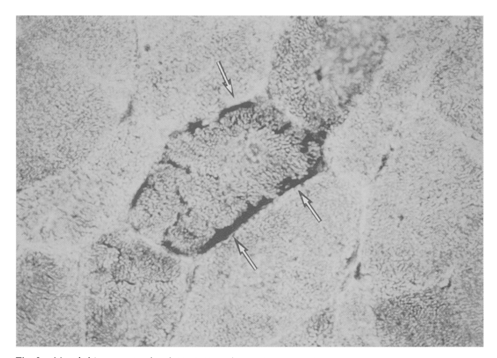
Fig. 2 Muscle biopsy stained with NADH oxidase technique. Subsarcolemmal aggregates of normal and abnormal mitochondria (*) are apparent.

The neurologic examination showed normal pupils that responded well to light and accomodation. Ocular movements were restricted to a few degrees in any direction. Slight ptosis of the lids was noted. Ophthalmoscopic examination did not reveal retinal pigment, optic atrophy or arterial narrowing. Hearing was diminished bilaterally, with air conduction better than bone conduction. Deep tendon reflexes were normal, except for knee reflex that was diminished. There was generalised muscular atrophy and no fasciculations were observed. Cerebrospinal fluid glucose concentration was 63 ml/dl, protein