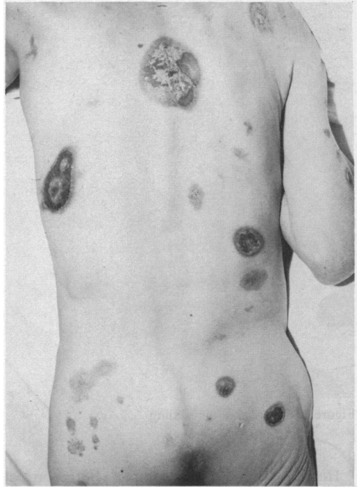
Figure 1. The eruption six weeks after it was first observed. Note the crusting, annular erythema and ulceration