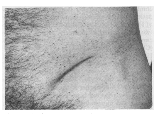
Figure 2. Angiokeratomata on the abdomen

knees. There was a telangiectatic background to the lesions over the abdomen. Examination of the urine under polarized light showed the presence of typical lipid-laden macrophages, known as 'Maltese Cross bodies'. Skin biopsy revealed a low level of the enzyme alpha-galactosidase A in cultured skin fibroblasts (4.7 nmol/h/mg protein; normal range 78–165). These investigations conclusively proved a diagnosis of Anderson-Fabry disease.