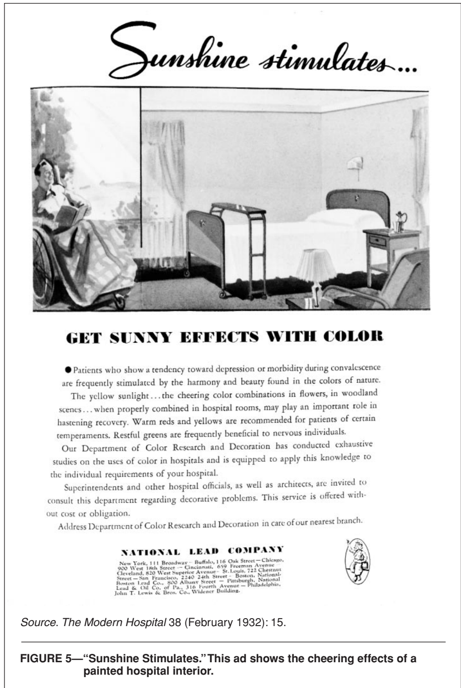
FIGURE 5—“Sunshine Stimulates.” This ad shows the cheering effects of a painted hospital interior.