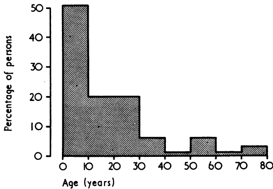
FIG. 2. Percentage distribution of age of onset among 69 familial cases of myasthenia gravis from the literature, where the age of onset has been clearly stated.

myasthenia gravis (see Appendix). Fig. 2 gives the distribution of the age of onset in these familial cases. Using the Wilcoxon-Mann Whitney non-parametric U test the distribution was found to be significantly different from that of our non-familial sample (Fig. 1). This suggests that the familial and non-familial forms of myasthenia