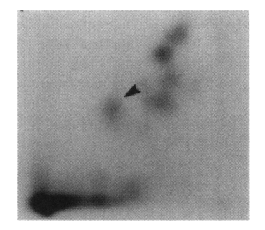
Figure 1. TLC pattern of MelQx–DNA adduct (1.4/10^9 nucleotides) formation in the human colon. The arrowhead indicates a spot corresponding to deoxyguanosin-8-yl-MelQx 5'-monophosphate. TLC was performed as described by Tada et al. ( 13 ).

MeIQx- and PhIP-DNA adduct levels in human organs were analyzed by the ^{32} Ppostlabeling method, with modifications (13). DNA was digested with spleen phosphodiesterase and micrococcal nuclease, and