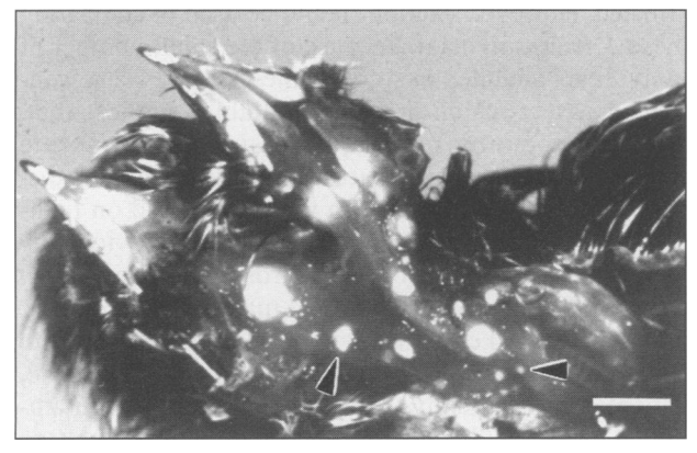
Figure 2. The esophagus of this common redpoll contains multifocal areas of caseous necrosis of variable size (arrowheads). Salmonella Typhimurium was isolated in large numbers from this organ; bar = 4 mm.

southeast regions (Figure 1). The common redpoll was the species most frequently reported (242 individuals). Other species included: American goldfinch (n = 6), evening grosbeak (n = 5), house sparrow (n = 4), pine siskin (n = 1), black-capped chickadee ( Poecile atri capillus ) (n = 1), snow bunting ( Plectrophenax nivalis ) (n = 1), brown-headed cowbird ( Molothrus ater ) (n = 1), pine grosbeak ( Pinicola enucleator ) (n = 1), and hoary redpoll ( Carduelis hornemanni ) (n = 1).