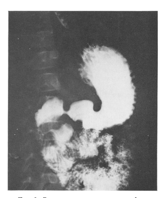
Fig. 3. Postoperative roentgenogram showing duplication of duodenum. Note that following enteroenterostomy, the duodenal duplication fills with barium from the jejunum. There is no connection with duodenal bulb or biliary system.

Veeneklaas,<sup>50</sup> in 1952, advanced the theory that best explains duplications found within the thoracic cavity. During the third week of embryonic life the notochord, which has its origin in cells from Hensen's node of the ectoderm, begins to form within the mesodermal mass. The notochordal process fuses with and becomes temporarily