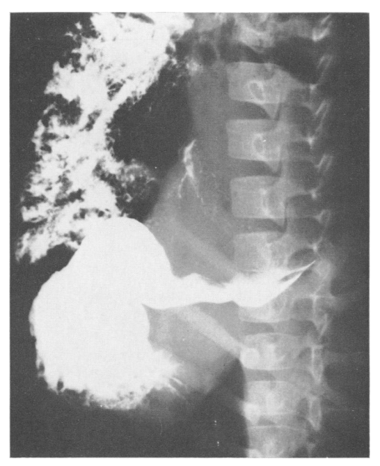
Fig. 1. Preoperative x-ray showing duplication of duodenum. Note mass displacing the duodenum superiorly, posteriorly, and laterally.